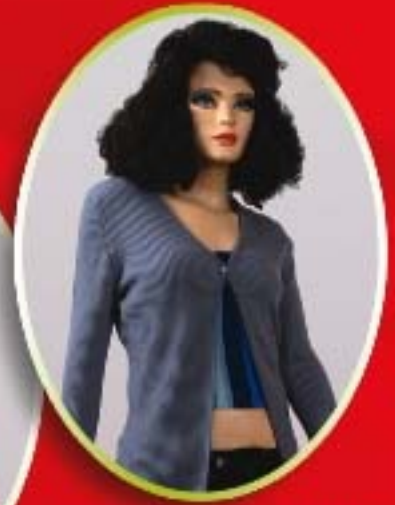
DESIGNED SINGLE BUTTON