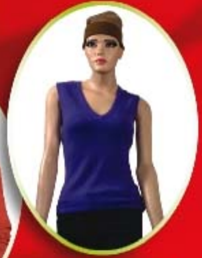
SELECTION V-NECK HALF