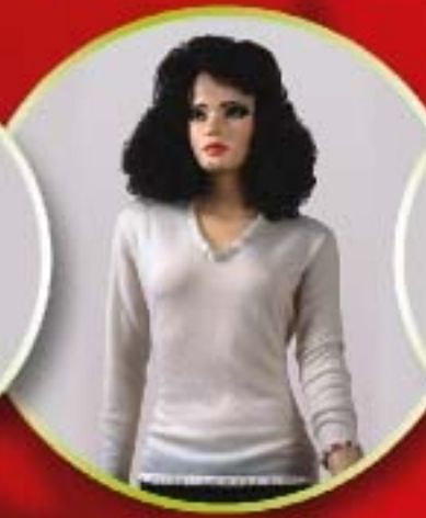
HUFFLER NECK CLOSE