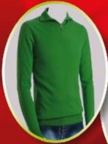
GENT POLO NECK