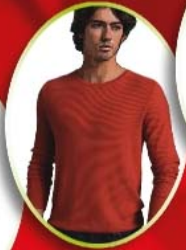
GENTS ROUND NECK